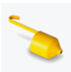
DEN01K Densimeter for varnishes