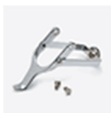
MRK04 for all HVLP spray guns KIT Trigger Assembly HVLP - Trigger assembly for spray guns - Lever screw for spray guns