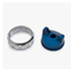
MRK01 KIT cap for paints/varnishes - Blue cap for water paints /varnishes - Chromed ring nut for spray guns