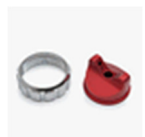
MRK02 KIT cap for varnishes - Red cap for varnish - spray guns - Chromed ring nut for spray guns