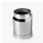
SER38iK Tank spray gun MRI-AS, ACT-AS and AXV-AS