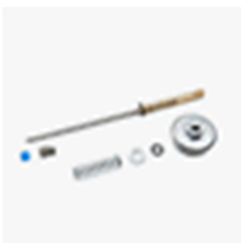
MRK03 for all HVLP spray guns KIT Needle Assembly spray gun HVLP - Nickel plated stuffing box for spray guns - Needle gasket for spray guns - O -ring for spray guns - Assembled needle for spray guns - Washer for spray guns - Back plug for spray guns - Needle spring for spray guns