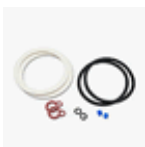
MRK08 for all HVLP spray guns KIT gaskets spray guns HVLP, ACT HVLP and AXV LVLP (all) - 2 Needle gasket for spray guns - 2 Spring gasket for spray guns (NEW) - 2 O-ring for spray guns - 2 Tankholding gasket spray gun - 2 Eight-shaped gasket(MRI) - 2 Gasket for surge tank lock cover MRI-AS, ACT-AS and AXV-AS